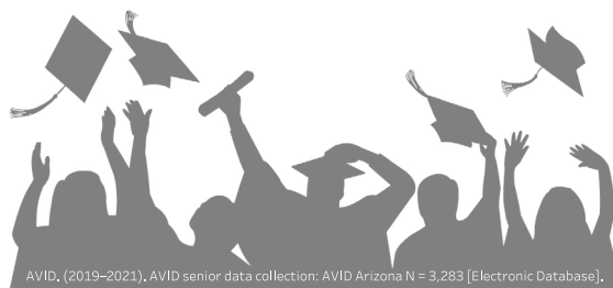
AVID. (2019–2021). AVID senior data collection: AVID Arizona N = 3,283 [Electronic Database].

of AVID Arizona Seniors Completed Four-Year College Entrance Requirements